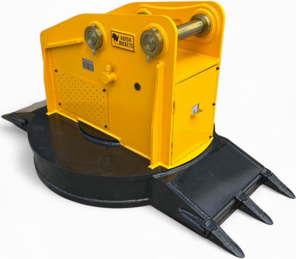
*Pictured model: 25-30T Hydraulic Electromagnet